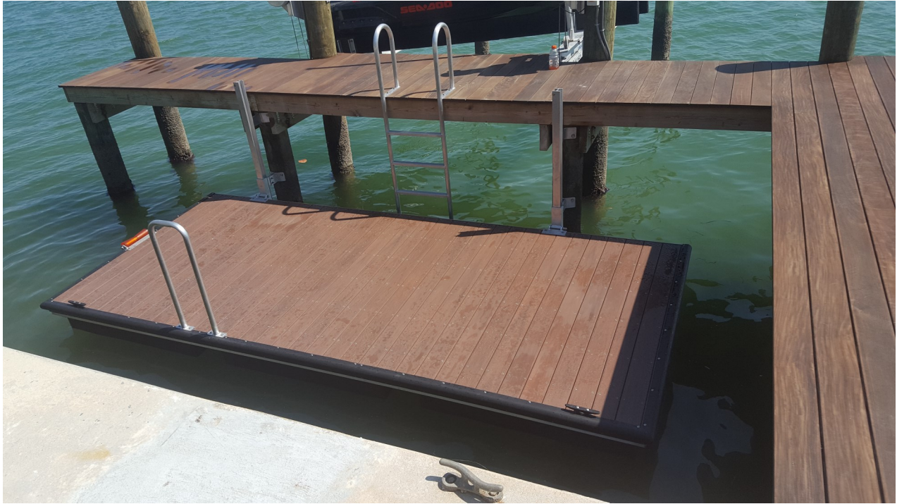
Shown with Rosewood AccuDeck Featuring Wolf PVC Decking

Our unique manufacturing process enables us to create a low profile 5'x14' floating dock for paddle boarders that has a freeboard as low as 6" from the water. This provides a safe, stable and almost water level surface to launch your SUP from. The waist high railing provides even more stability as you get on and off of your SUP board.