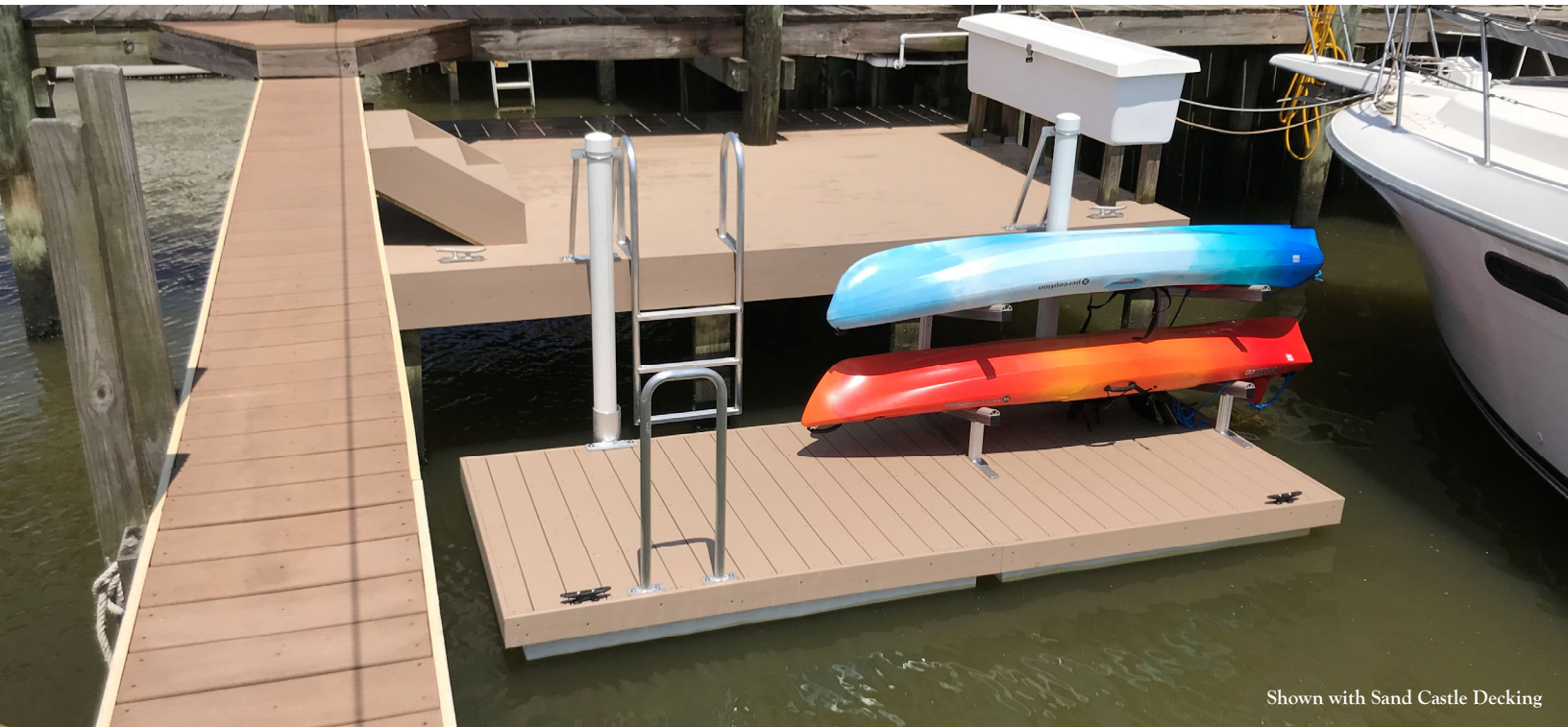
Shown with Sand Castle Decking

Our unique manufacturing process enables us to create a low profile 5' x 14' floating dock for paddleboarders that has a freeboard as low as 6" from the water. This provides a safe, stable and almost water level surface to launch your SUP from. The waist high railing provides even more stability as you get on and off of your Paddleboard.